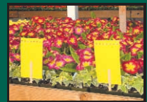
Stake Along Edges

Peel the release paper from the trap. Place trap where insects have been seen. Place the trap on end or on its side in pots, hang it using a twist tie or string, or attach it to one of the enclosed stakes. Put traps near and above fruit, vegetables or other sources of insects. Use one trap per infested group of four plants, or, for heavy infestation, use one trap at the base and one at the crown of each infested plant. Dispose of traps when they are full or after 3 months. These traps are made of paper, not plastic, and can be composted or placed in a worm bin.