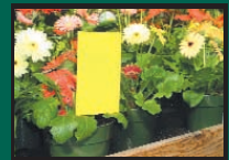
Place In Pot